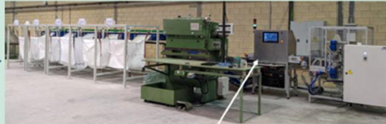
Multisensor module for sorting