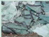
Laminated Glass wastes